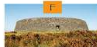
F GRIANAN OF AILEACH