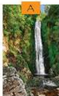
A GLENEVIN WATERFALL

A few key spots in beautiful Inishowen to visit along the way.