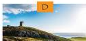
D MALIN HEAD