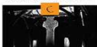
C DONAGH CROSS