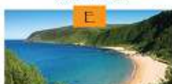
E KINNEGOE BAY