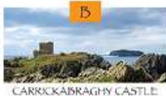
B CARRICKABRAGHY CASTLE