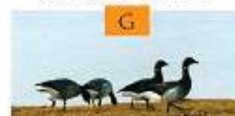
G INCH WILD FOWL WALK